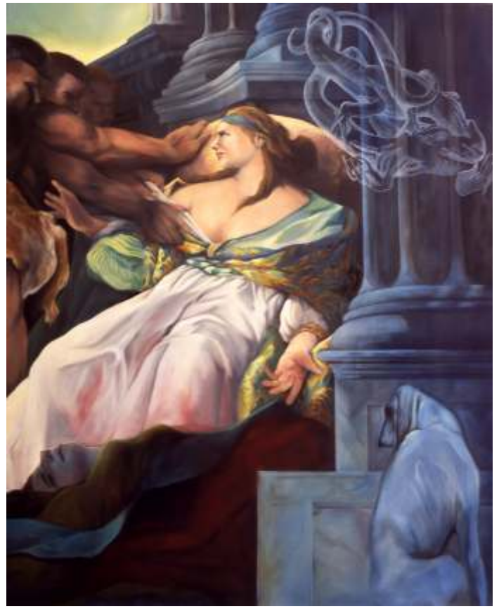
Death of Harmonia, Oil on Canvas, 66"x 56"