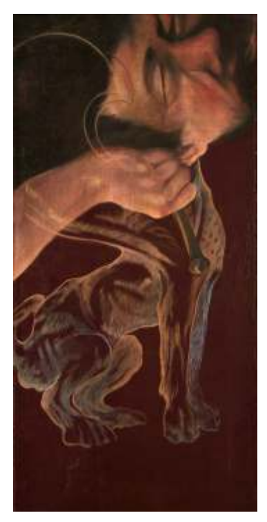
Editing Evil, Oil on Canvas 36"x 18"