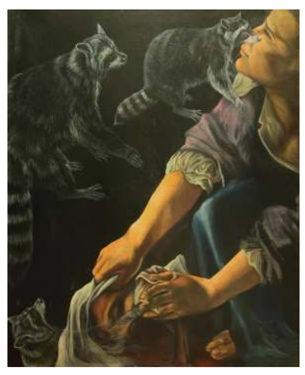
Coons, Oil on Canvas, 54" x 48"